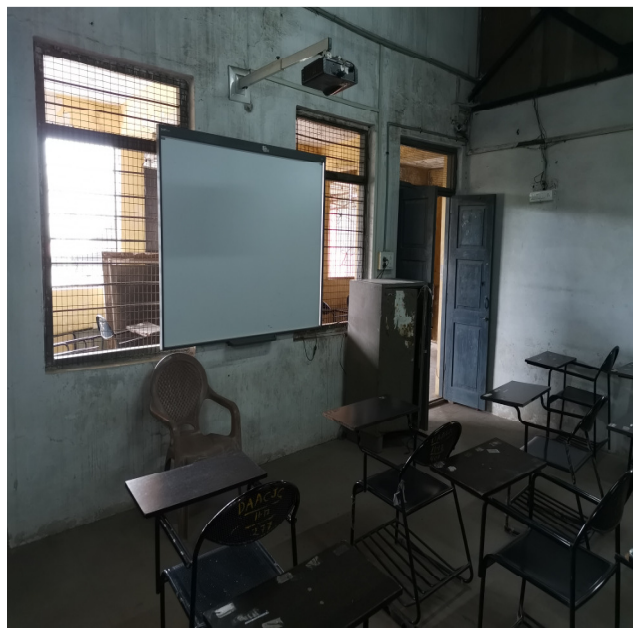
Class Room/Tutorial Room Facilities-2