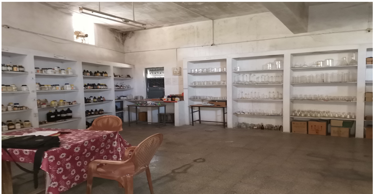
Main Store Room