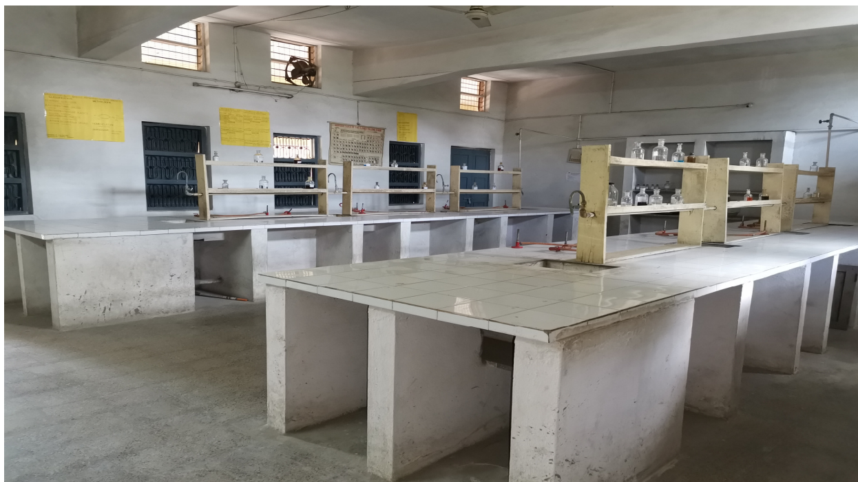
Pharmaceutical Chemistry Lab