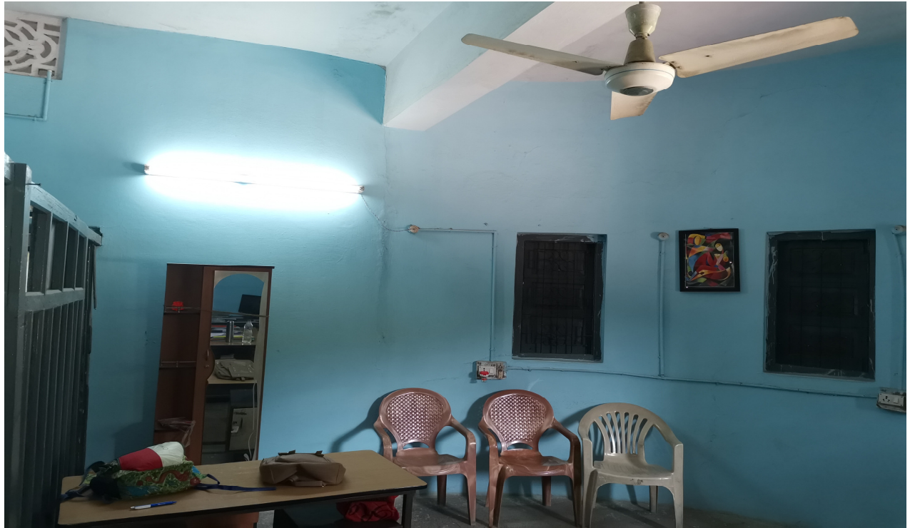
Girls Common Room (GCR)